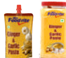
200 g 1 kg