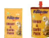
25 g 90 g