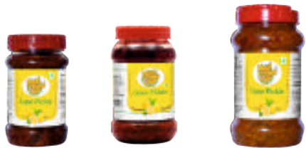
200 g 500 g 1 kg