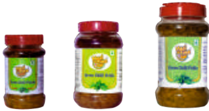
200 g 500 g 1 kg