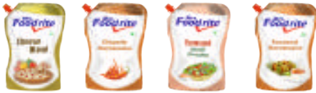
Cheese Blend Chipotle Mayonnaise Thousand Island Dressing Tandoori Mayonnaise