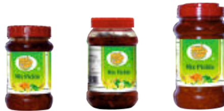
200 g 500 g 1 kg