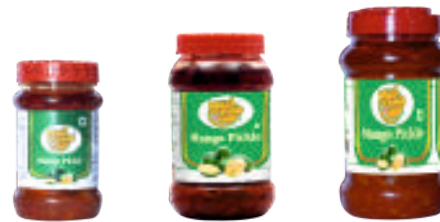
200 g 500 g 1 kg